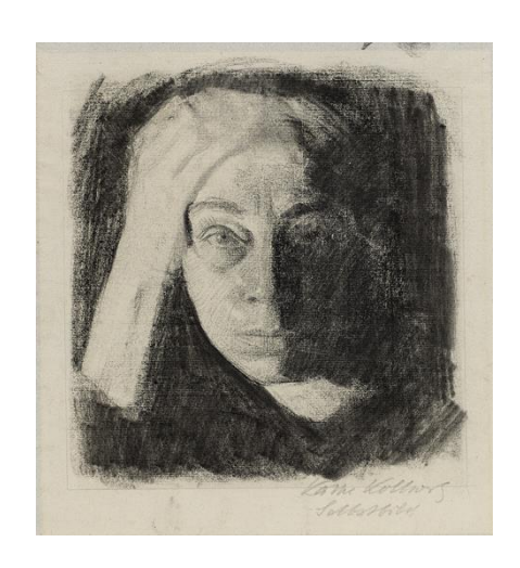
Käthe Kollwitz, Charcoal.