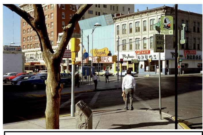
Stephen Shore, Landscape

Here are some photographers to get started: