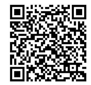
Edexcel AS and A level Art and Design 2015 | Pear... gualifications.pearson.com

Use the weblink or QR code to read about the specification and you can also view past papers to see what the assessment looks like.