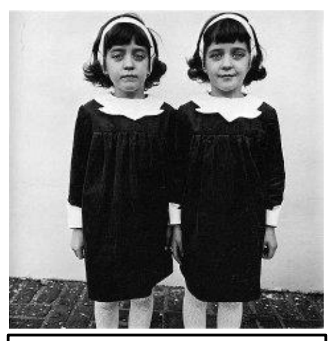
Diane Arbus, Portraits